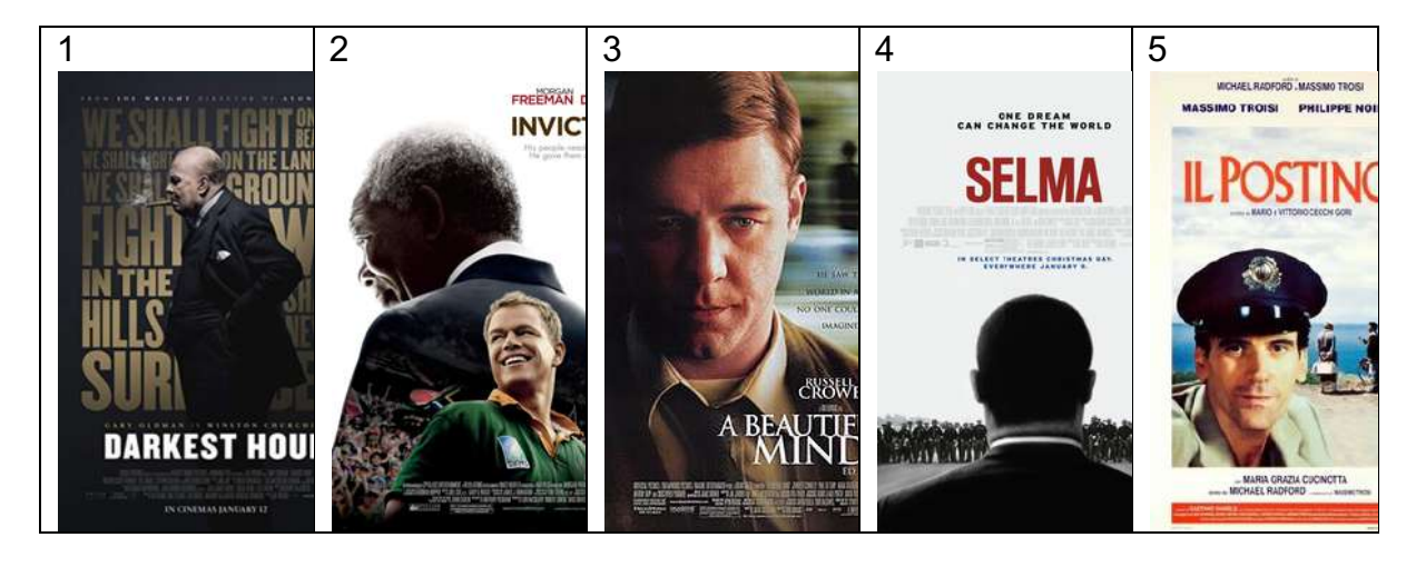
Round 1: Nobel Prize winners in film

For each of the 5 movies, name the Nobel Prize winner featured and the category of Nobel Prize for which they won.